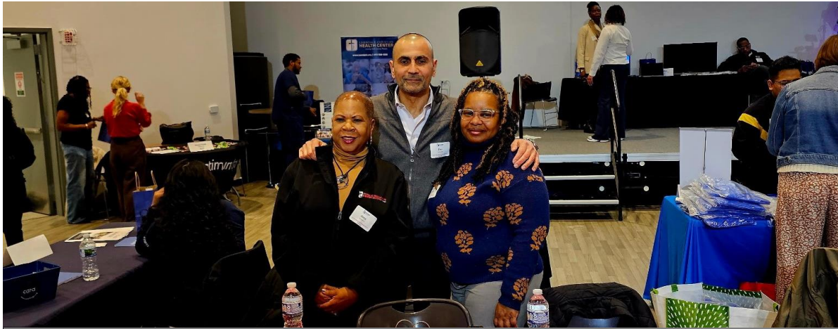
GRIP Future Steps Job and Career Fair