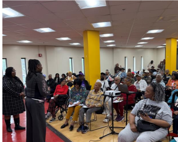
DFSS Bronzeville Regional Senior Center: Community Meeting