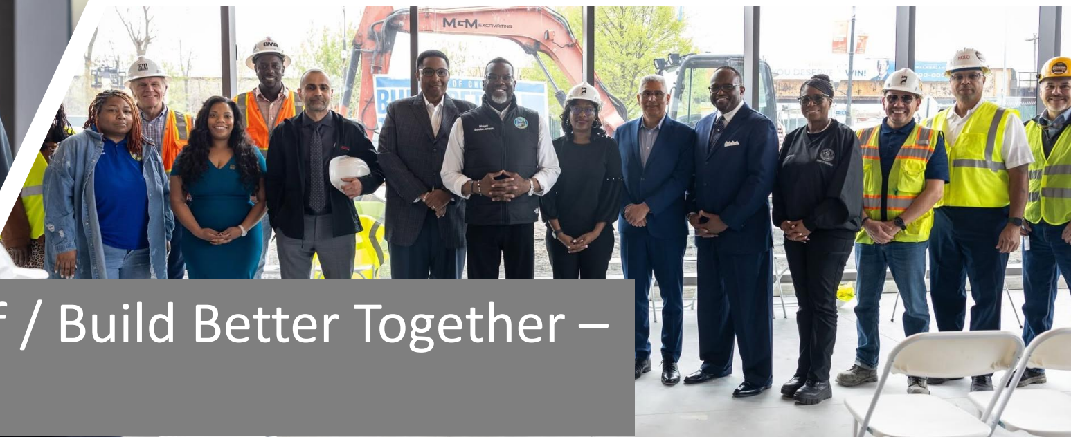
Construction Season Kick-Off / Build Better Together – MXC West Campus