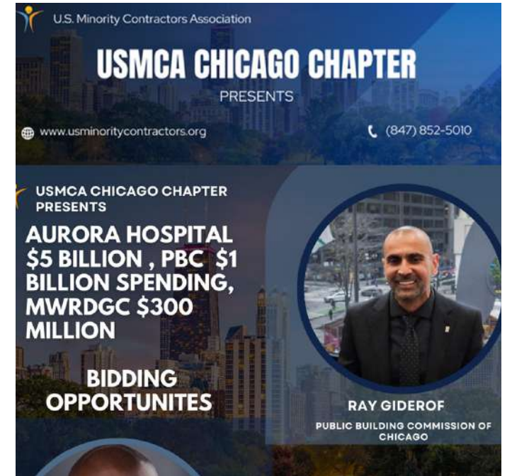
On September 25th, PBC presented at the meeting of the U.S. Minority Contractors Association, one of PBC's Assist Agencies. It was a great forum for PBC to inform the members regarding upcoming opportunities. PBC and the U.S. Minority Contractors Association will conduct follow-up meetings.