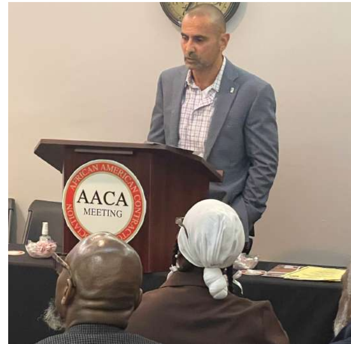
On September 17th, PBC presented at the monthly meeting of the African American Contractors Association, another one of PBC's Assist Agencies. We shared details regarding PBC's current and upcoming procurement opportunities during the meeting.