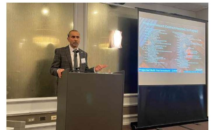
On October 23rd, PBC presented at the Federation of Women Contractors' Meeting & State of the Industry Luncheon where we presented about upcoming opportunities and how promising contractors and professional service providers can participate in PBC projects.