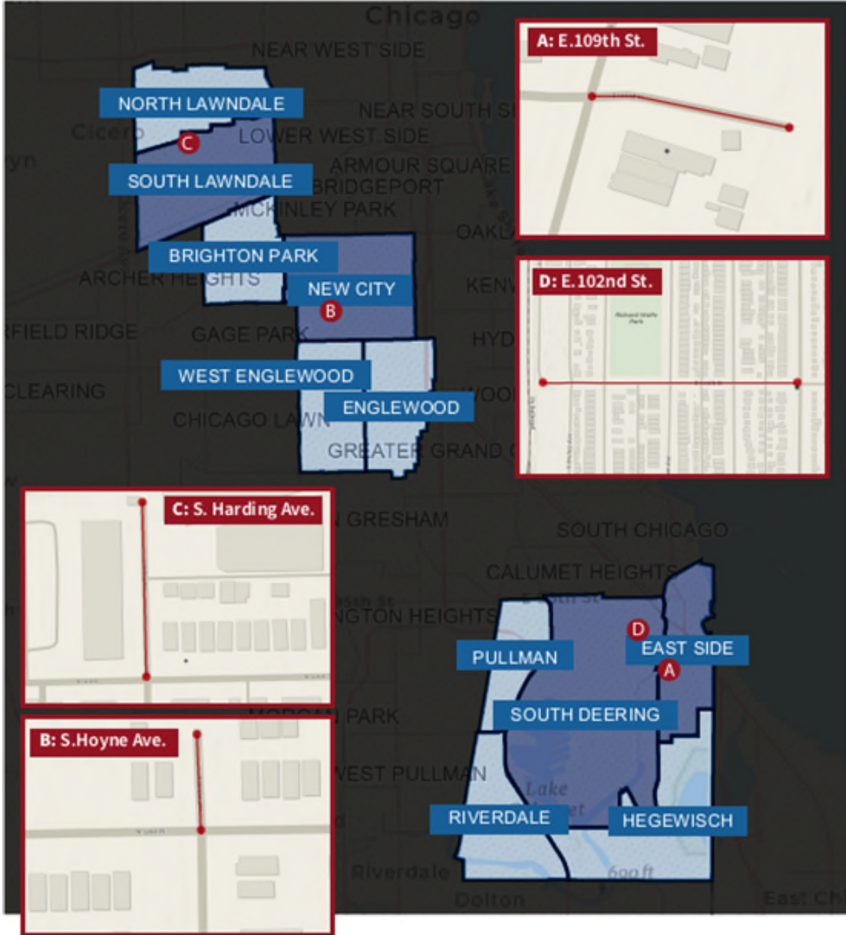
EXHIBIT #3 PROJECT COMMUNITY AREA MAP