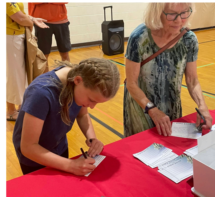
Morgan Shoal Community Open House