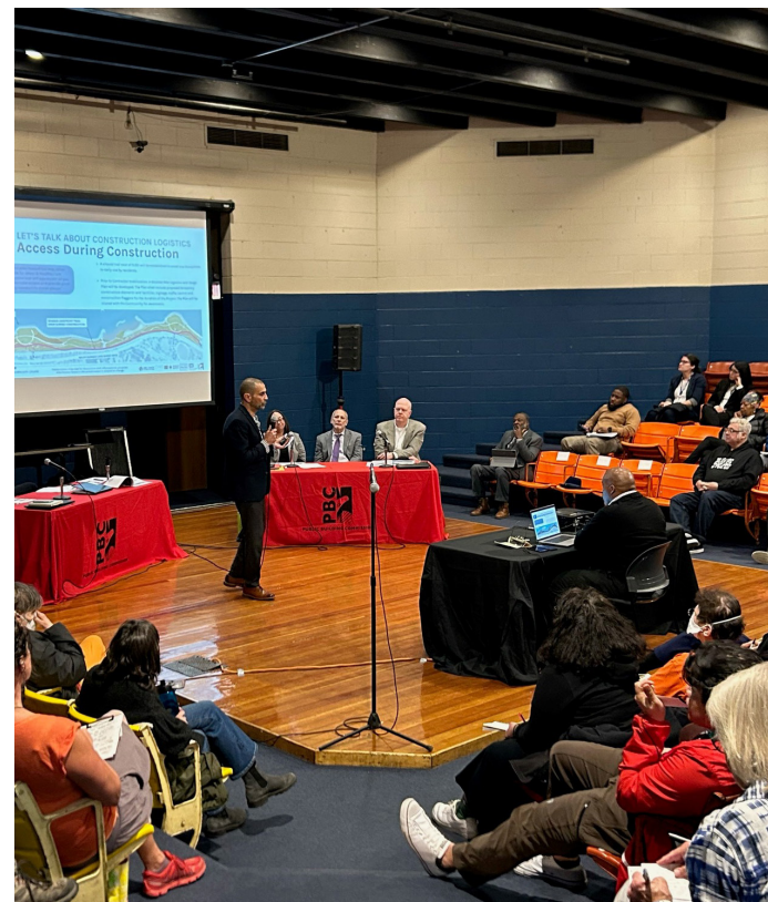
Morgan Shoal Community Meeting # 3