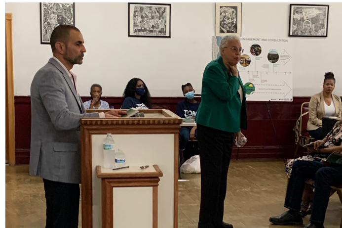
Monumental Baptist Church's Community Meeting

The Public Building Commission of Chicago (PBC), the Chicago Department of Transportation (CDOT), Chicago Park District (CPD) and the U.S. Army Corps of Engineers (USACE), hosted three 'in-person' community meetings, participated in Monumental Baptist Church's community meeting and presented an 'open house' for the Morgan Shoal Revetment Reconstruction project. During all community engagements efforts, representatives provided responses and updates to the input and questions while offering information on the project status.