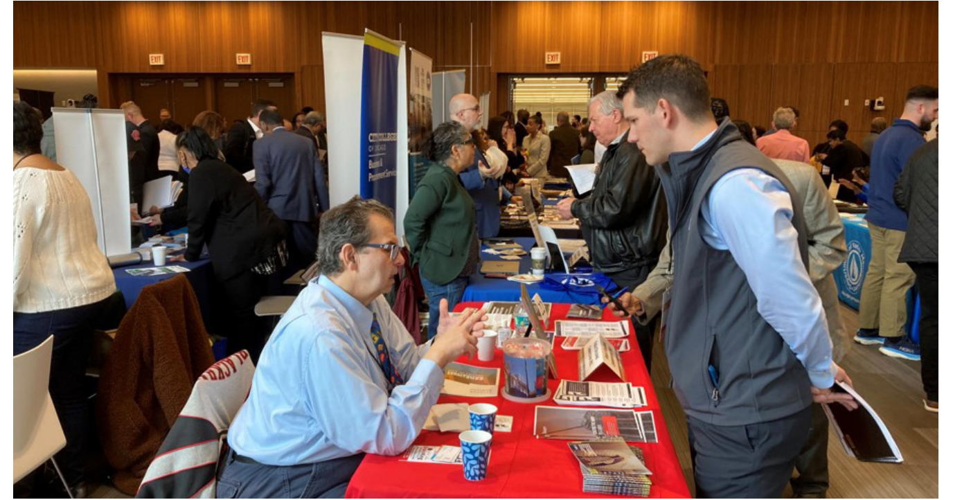
The PBC participated in the City of Chicago's 2024 Construction Summit where individuals interested in learning more about doing business with the City and government agencies had an opportunity to participate in a day of Leaders Roundtables and Chats for businesses at all levels.