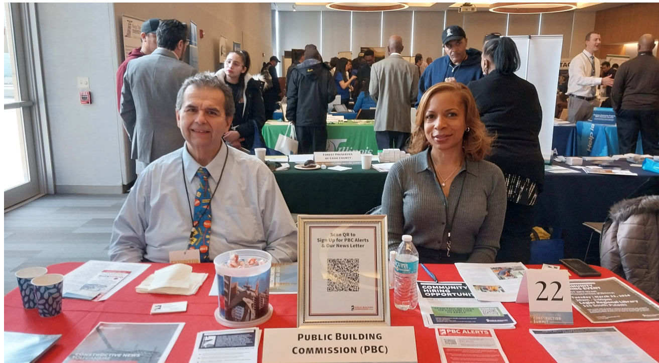
The PBC attended the 2024 DPS Construction Summit.