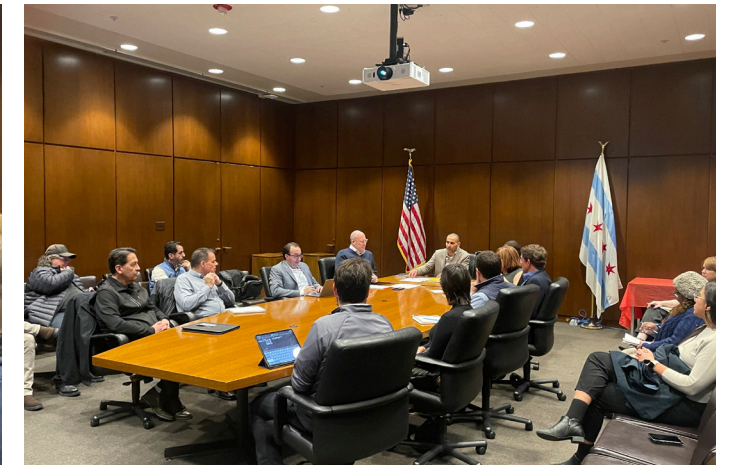
Pre-Qualified General Contractors Roundtable