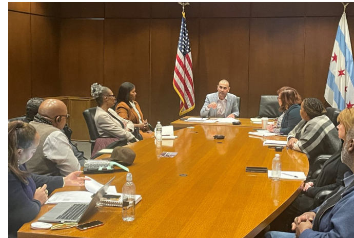
Assist Agency Roundtable

The PBC hosted Assist Agency and Pre-Qualified General Contractors Roundtables as a part of the PBC’s commitment to reinforce partnerships and discuss opportunities and equity. The discussions help to fuel and strengthen the effort to produce the highly successful inaugural ‘Connection Session’ where PBC’s talented pre-qualified general contractors and pre-approved Job Ordering Contractors (JOC) firms had an opportunity to connect with established or up and coming minority and women business enterprise firms, subcontractors, vendors, and suppliers.