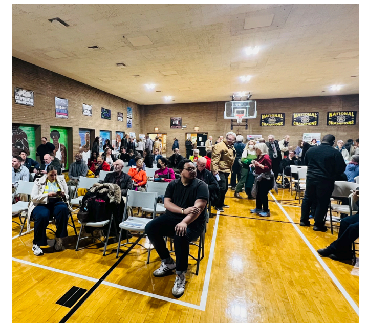
Morgan Shoal Community Meeting # 1