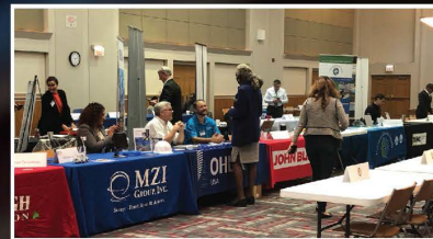
The PBC participated in the MWRD 2023 Diverse Business Summit at Kennedy King College.