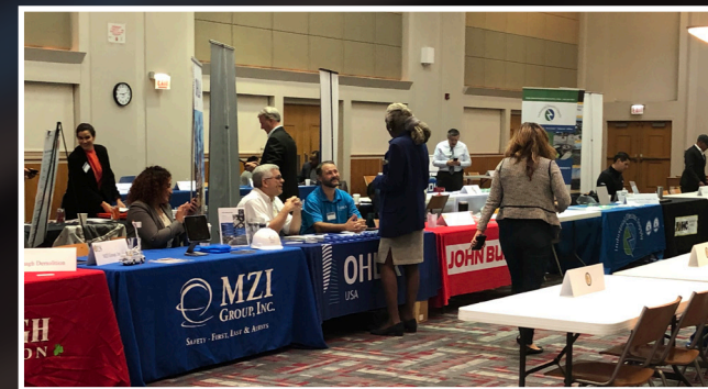
The PBC participated in the MWRD 2023 Diverse Business Summit at Kennedy King College.