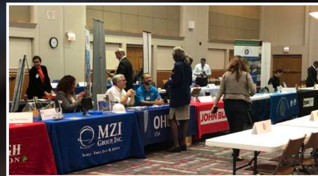
The PBC participated in the MWRD 2023 Diverse Business Summit at Kennedy King College.