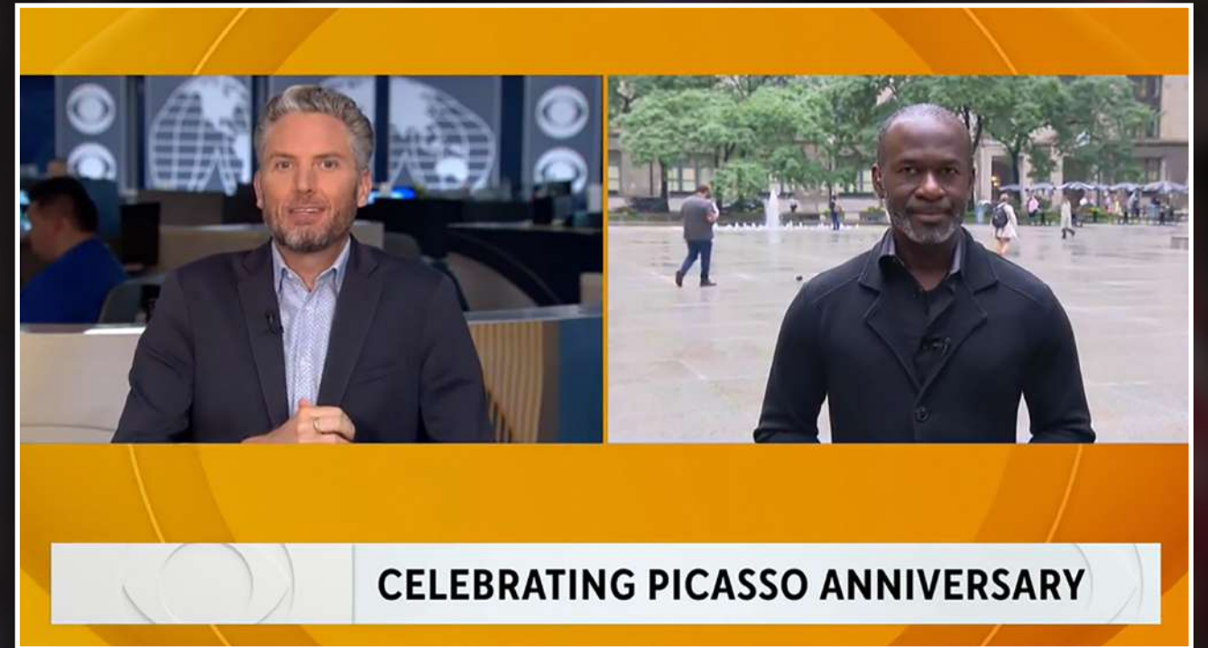
CBS News (Channel 2) celebrated the Picasso anniversary with a live look at the iconic sculpture with background information from PBC's own Kerl Lajeune.