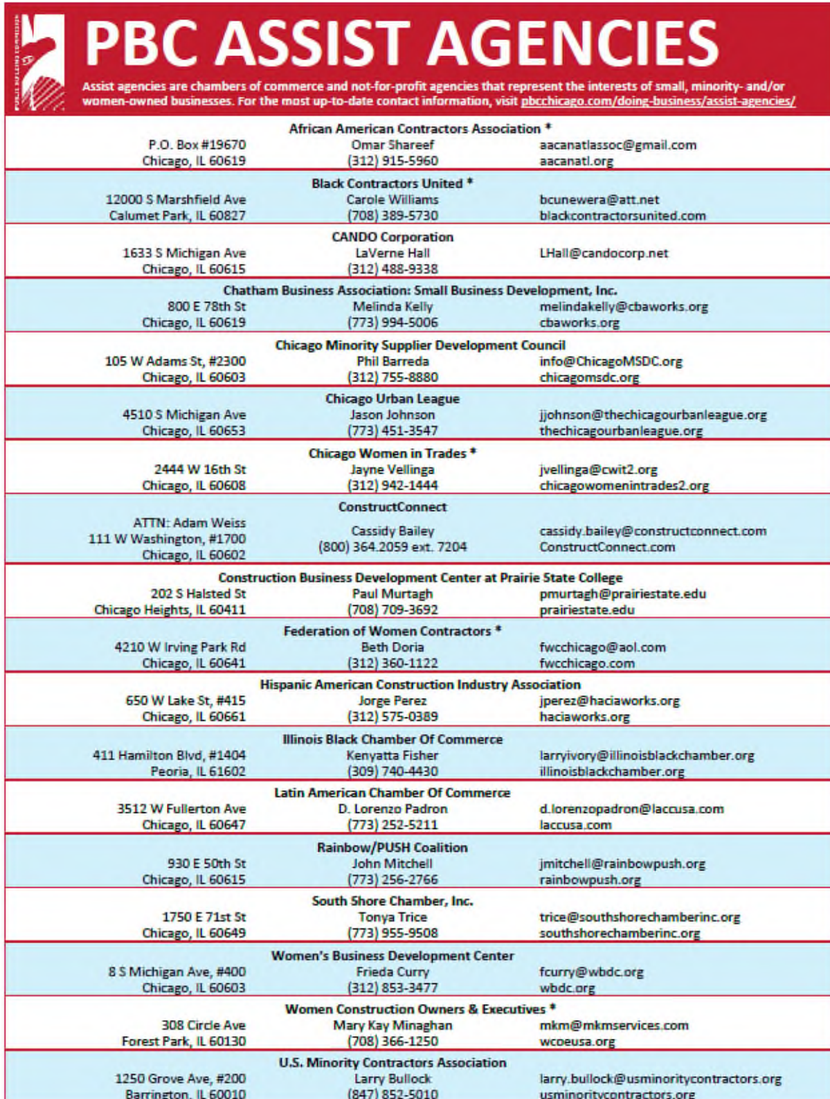
EXHIBIT #4 ASSIST AGENCIES