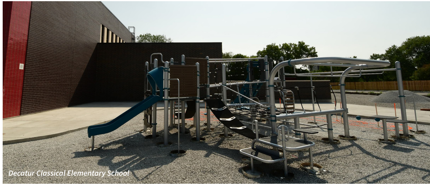
Decatur Classical Elementary School