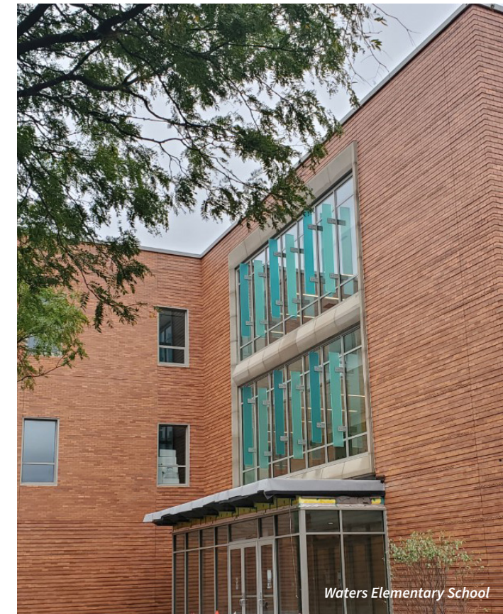
Waters Elementary School