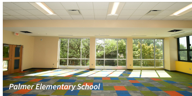
Palmer Elementary School

McDade Classical Elementary School added a new 9,700 sq. ft. gymnasium/multi-purpose room facility with classrooms to an existing one-story school building. The school now has the capacity to expand programming to include 7th and 8th grade while needed renovations to key areas of the existing school will improve the learning environment for all students.