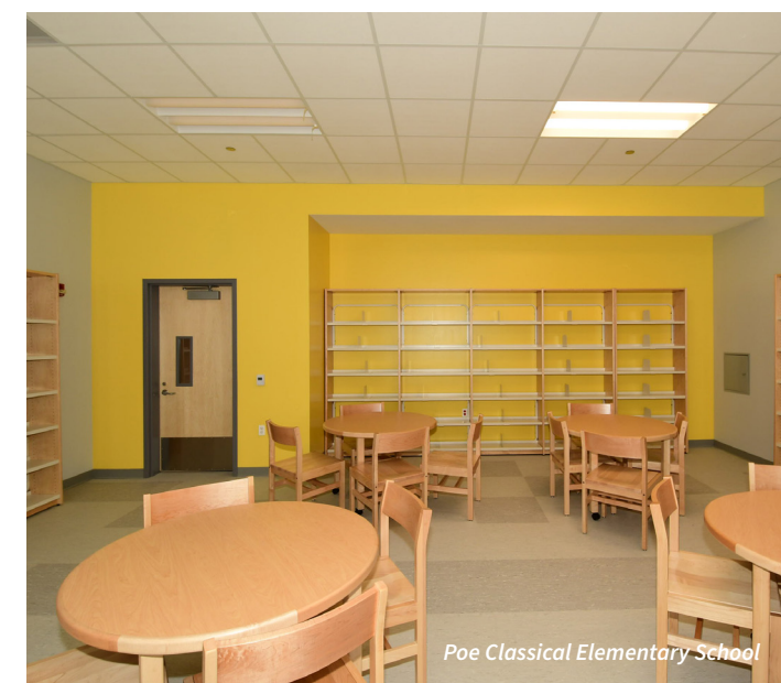
Poe Classical Elementary School