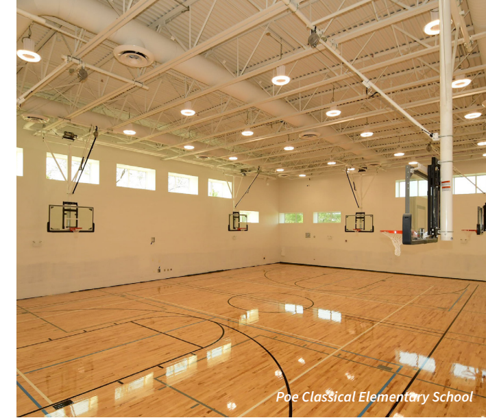
Poe Classical Elementary School

Edgar Allan Poe Classical School is a K-6 school on the South Side of Chicago in the historic North Pullman community. The diverse population of academically talented students will return to a 19,000 sq ft four story annex that will include a new gymnasium/multipurpose room, a new student dining/multipurpose room, hybrid kitchen and extensive renovations in the music, library and gymnasium spaces.