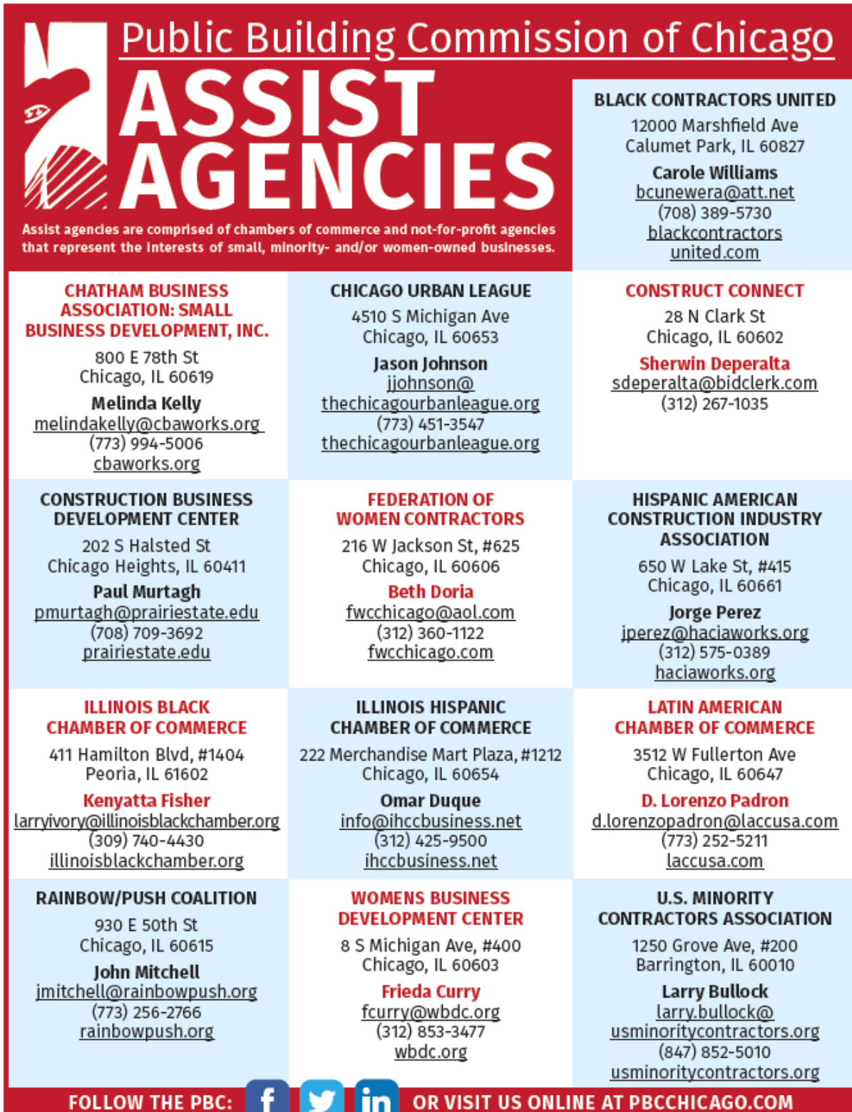
EXHIBIT #4 ASSIST AGENCIES