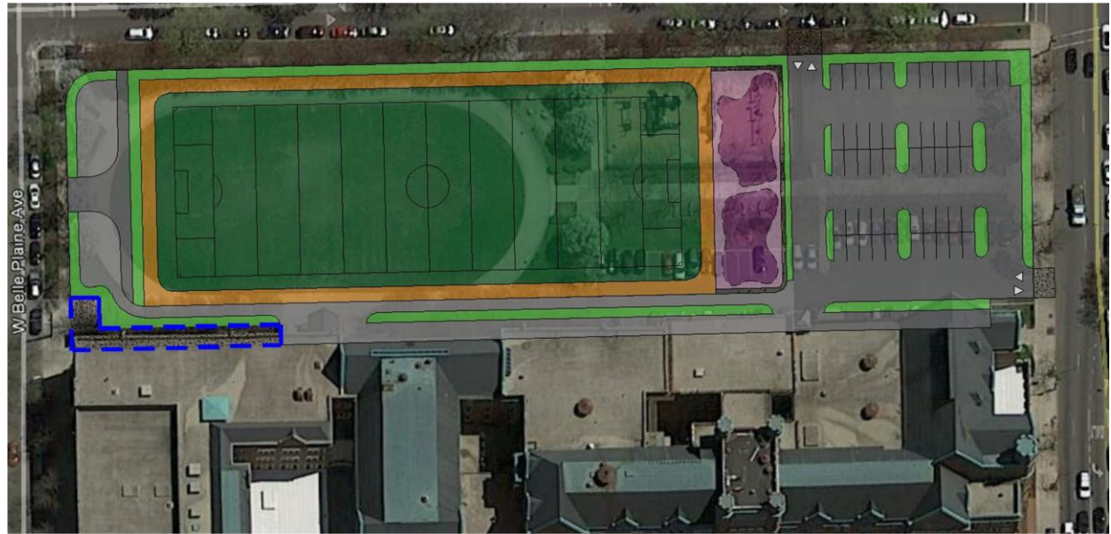
Site Plan: Renovated Practice Field