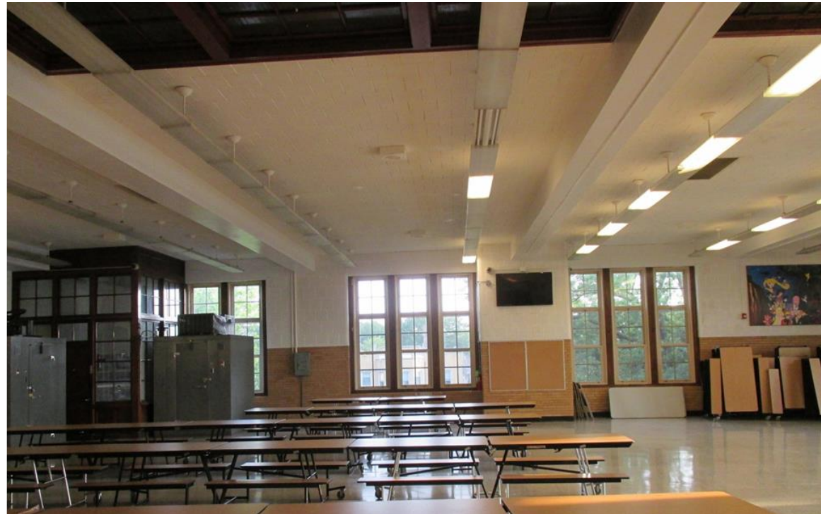
Example of Renovated Lunchroom