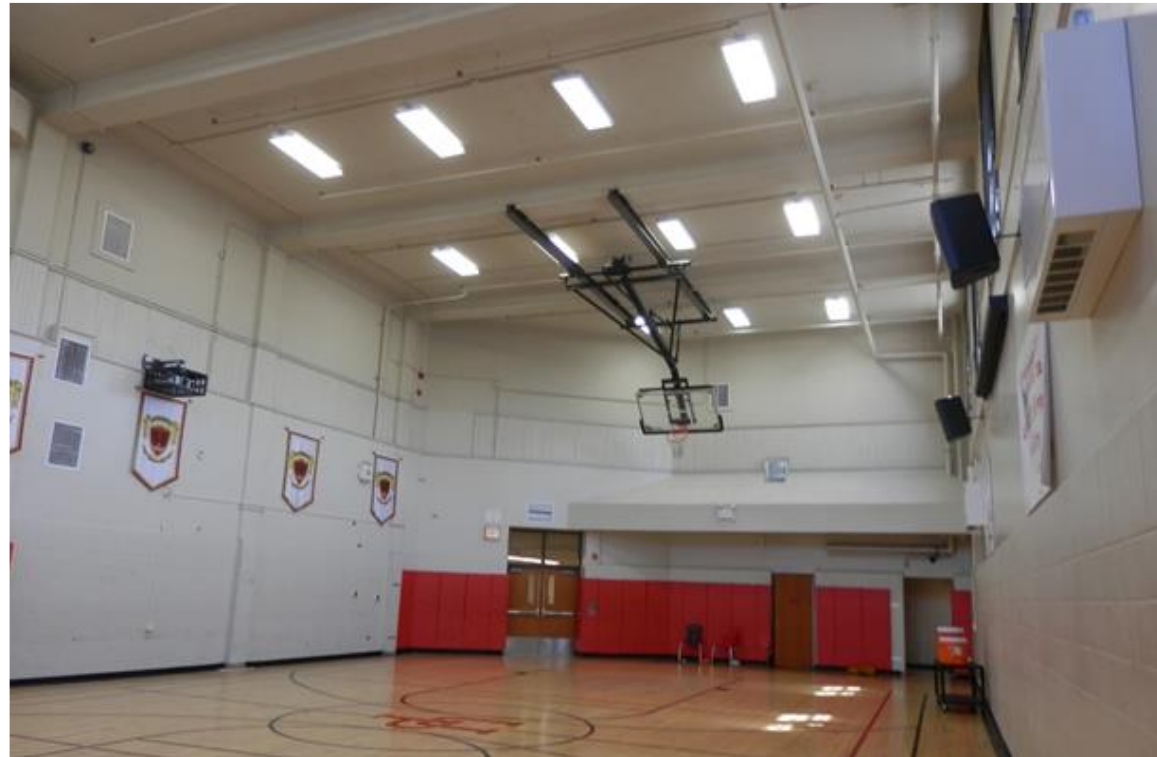
Example of Renovated Gymnasium