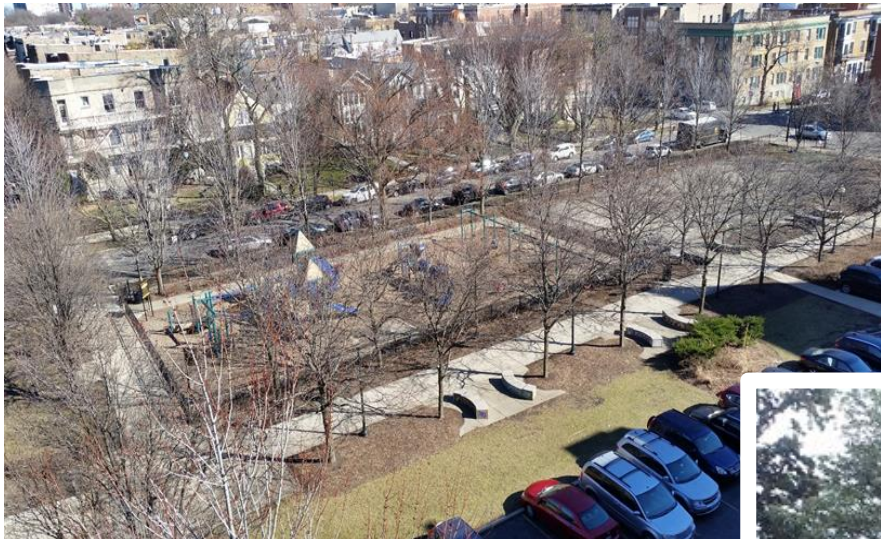
Existing Play Structure