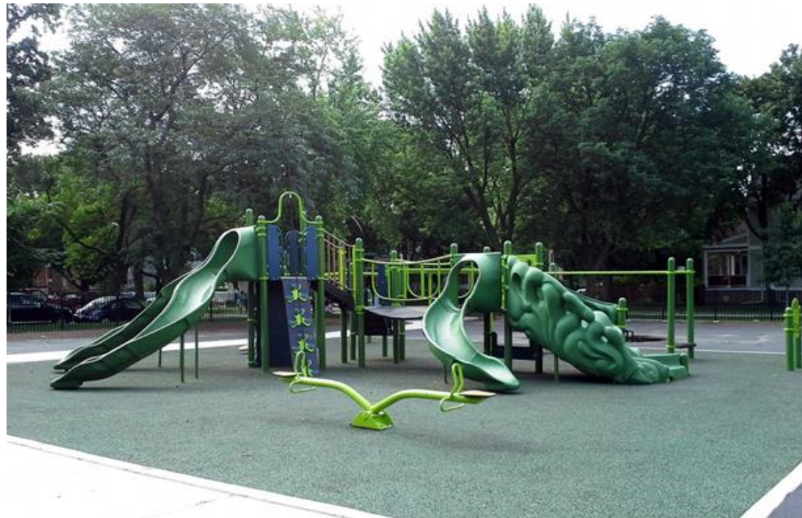
Example of New Play Structure