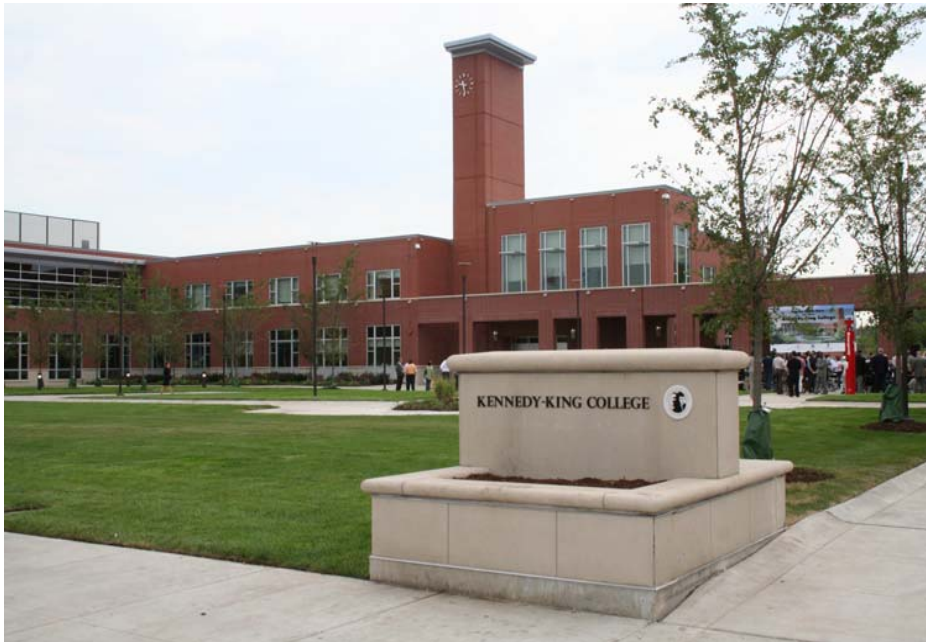
CITY COLLEGES OF CHICAGO