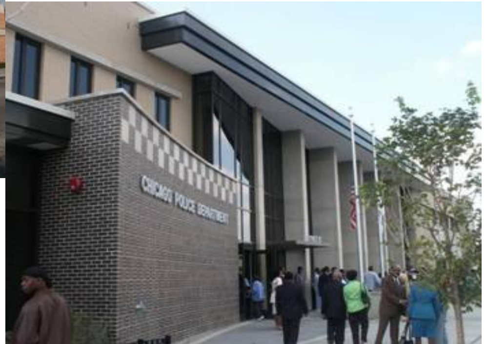
CHICAGO POLICE DEPARTMENT