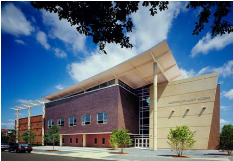
CHICAGO PUBLIC SCHOOL