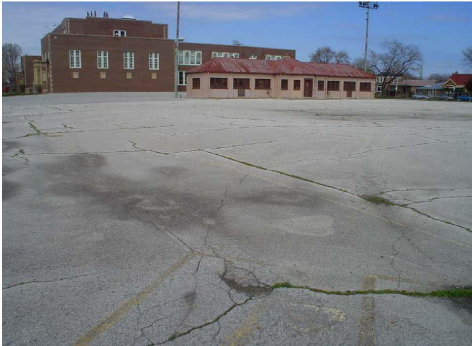
Prior to Construction