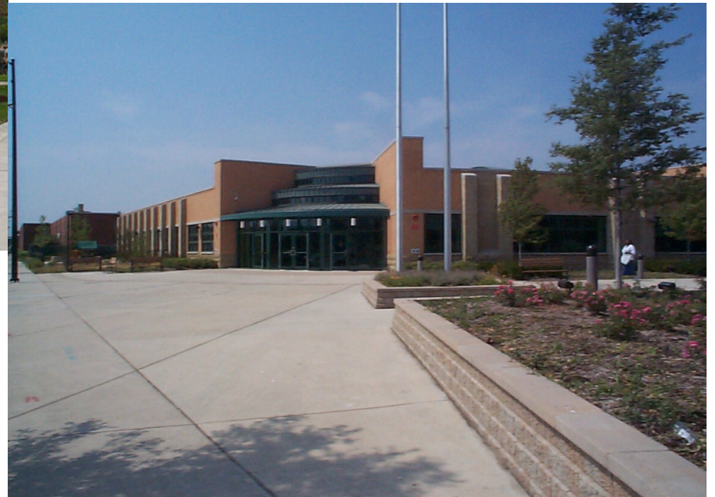
CHICAGO PARK DISTRICT