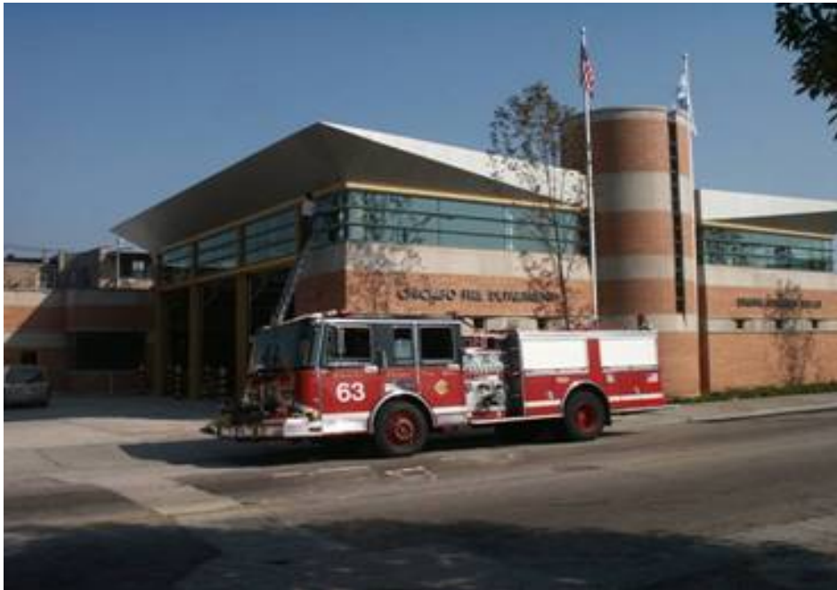
CHICAGO FIRE DEPARTMENT