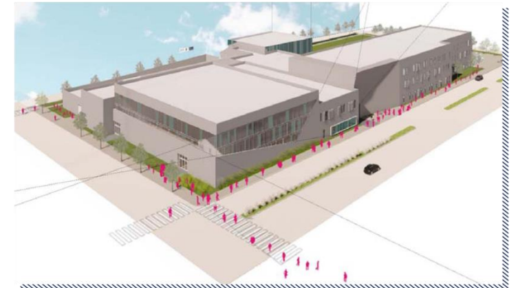
Hancock College Prep Replacement High School: Under Construction