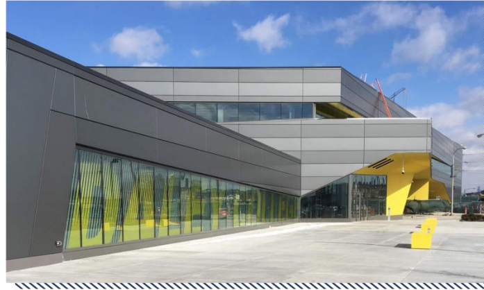
Daley College MTEC: Completed 2019

We continued our success with 'Design-Build' and 'Construction Management at Risk' delivery methods.