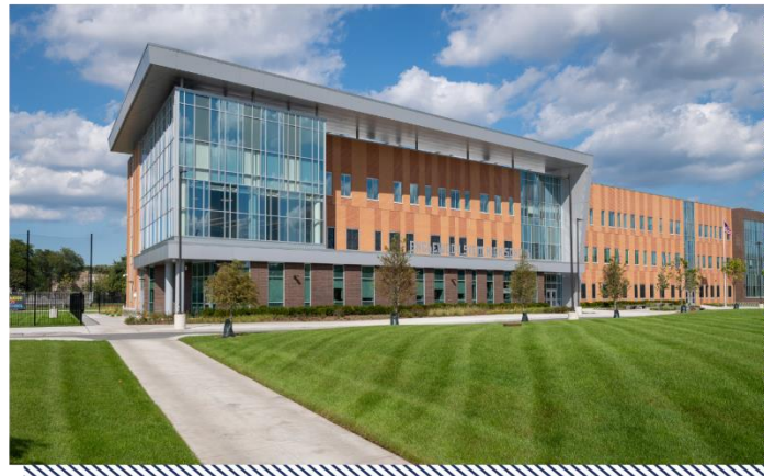
Englewood STEM High School: Completed 2019