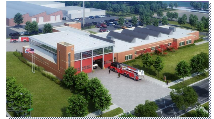
Engine Company 115: Under Construction