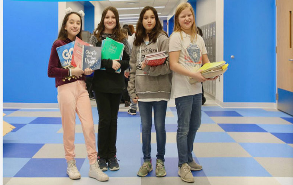
New Elementary Schools at Dore & South Loop; New Annexes at Prussing & Ebinger Elementary