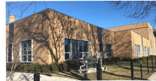
facing page: students in the hallway of the new Dore Elementary School; this page, from top: the new South Loop Elementary School, Dore's new building, the new annexes at Ebinger and Prussing Elementary School