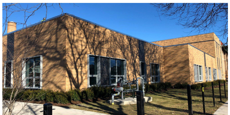
..... facing page: students in the hallway of the new Dore Elementary School; this page, from top: the new South Loop Elementary School, Dore’s new building, the new annexes at Ebinger and Prussing Elementary School