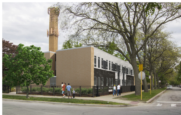
top to bottom: two photos of Mt Greenwood's Elementary School's annex under construction; a rendering of the school's new annex