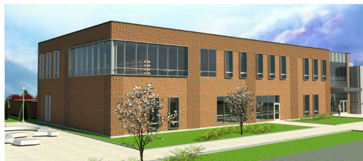
top to bottom: Esmond Elementary School's new annex; workers lay brick at Esmond Elementary School; a rendering of the new annex