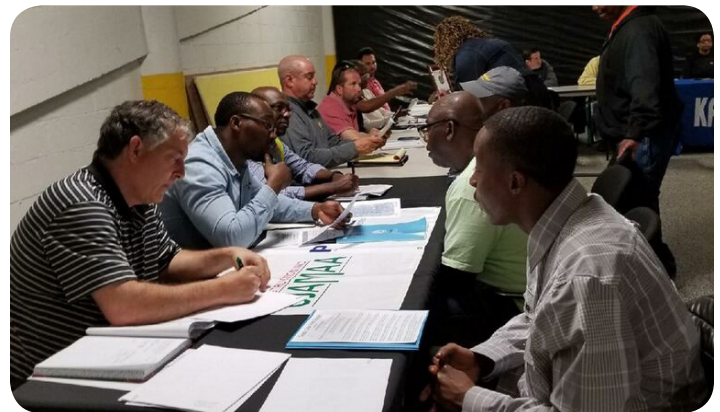
May 11, UJAMAA Construction: South Side High School