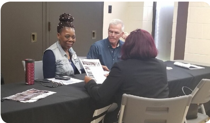
May 4, Robichaux Park Fieldhouse: Chicago Park District Group B Projects