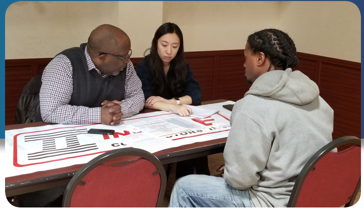
April 13, Charles A. Hayes Family Investment Center: Williams Park Fieldhouse