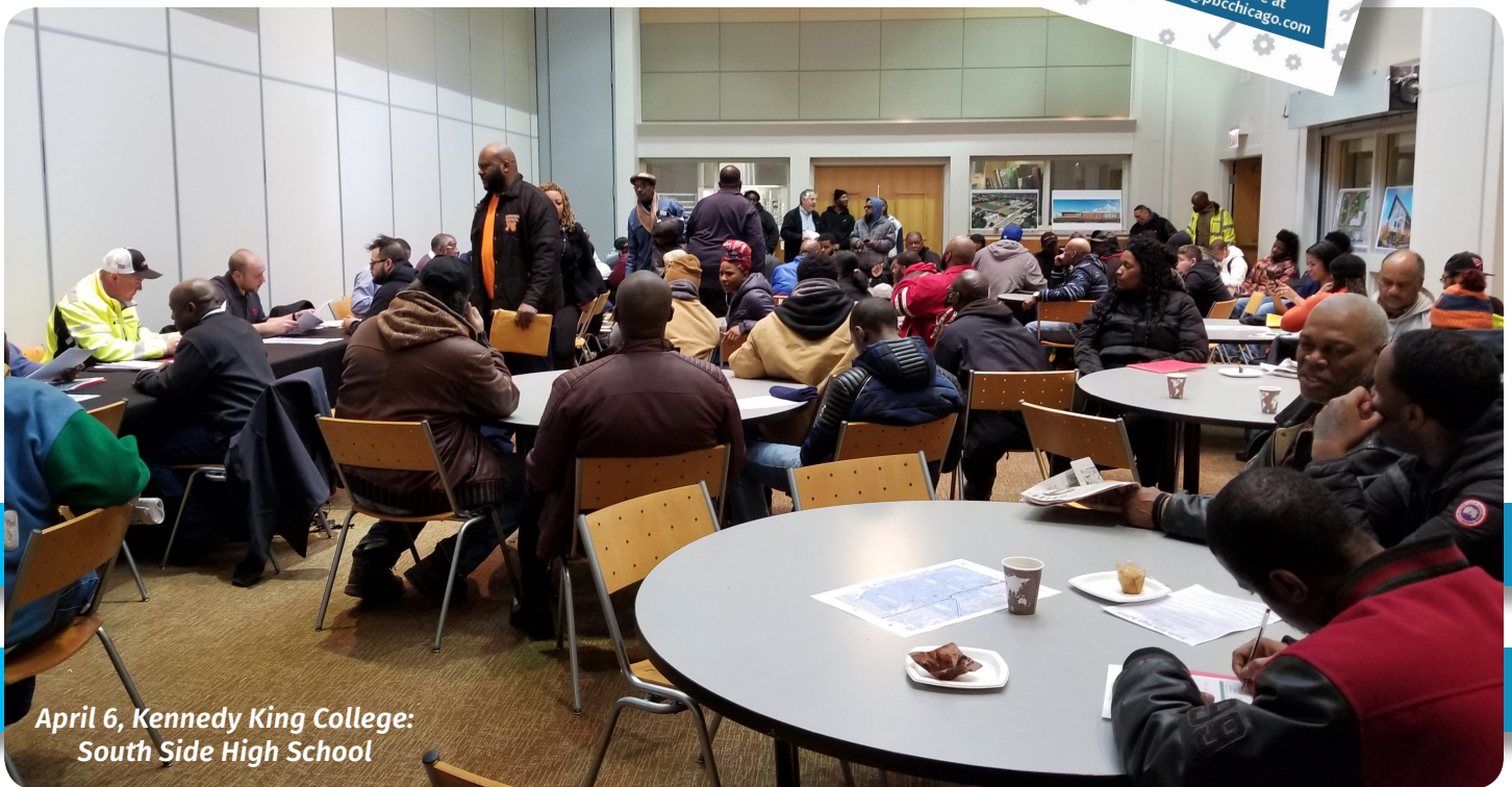
April 6, Kennedy King College: South Side High School