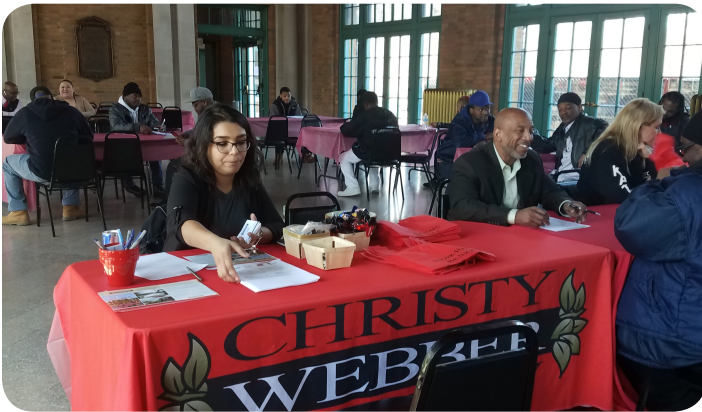
April 25, Columbus Park Fieldhouse: Chicago Park District Group A Projects