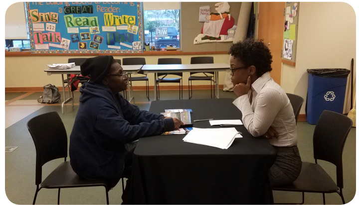
May 2, Dunning Branch Library: Read Dunning School