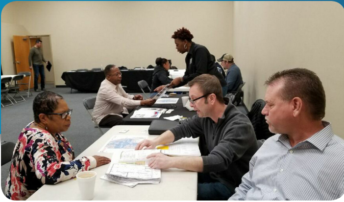
February 27, Chatham Business Association: Whitney Young Branch Library Addition & Renovation