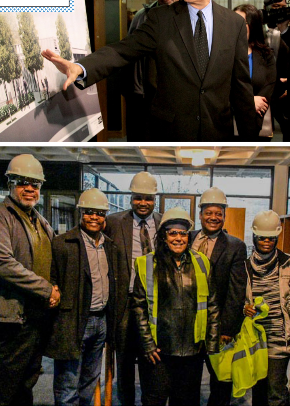
Previous spread: rendering of Whitney M. Young, Jr. Branch Library with its new a talks with Mayor Emanuel about the library's addition; Chicago Public Library Com F.H. Paschen, the project's General Contractor.

The exterior walls of the existing structure will remain in place, allowing CPL and PBC to do a complete gut rehab and expansion. In addition, the new design creates a welcoming and flexible space