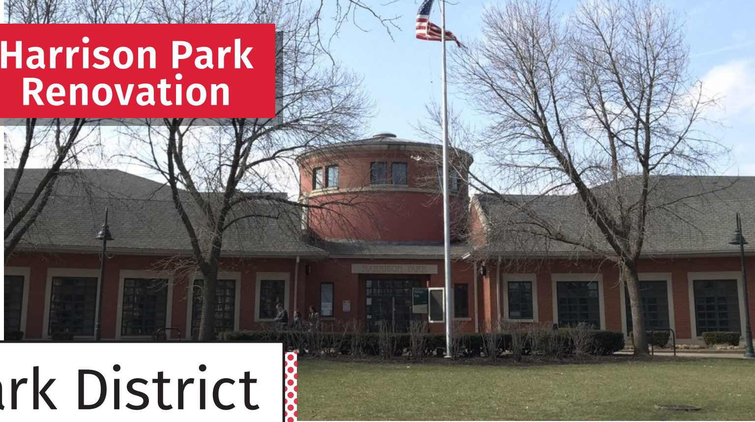
Harrison Park Renovation