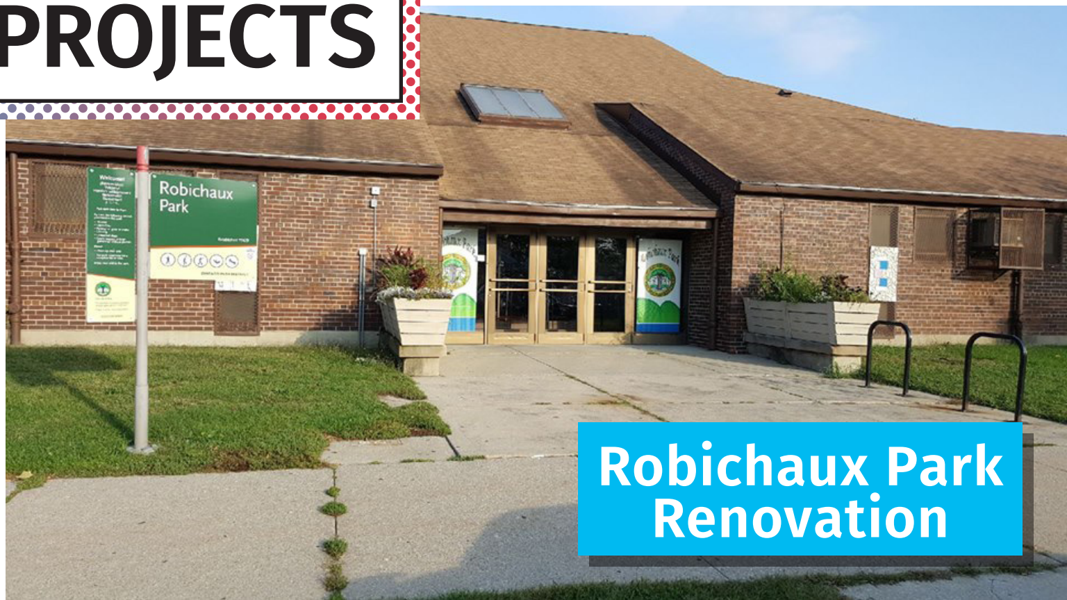
Robichaux Park Renovation