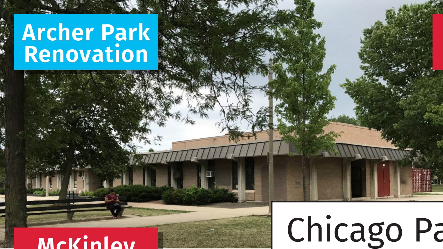
Archer Park Renovation