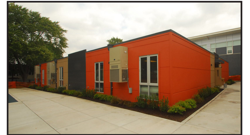
example modular building