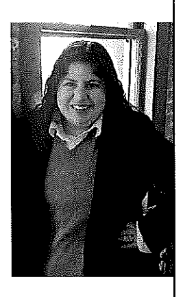
Education: Bachelor of Architecture -Illinois Institute of Technology, Chicago, IL