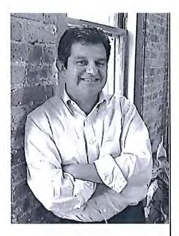
Education & Registration: Registered Architect: State of Illinois Master of Architecture: IIT, Chicago, IL Bachelor of Architecture: IIT, Chicago, IL