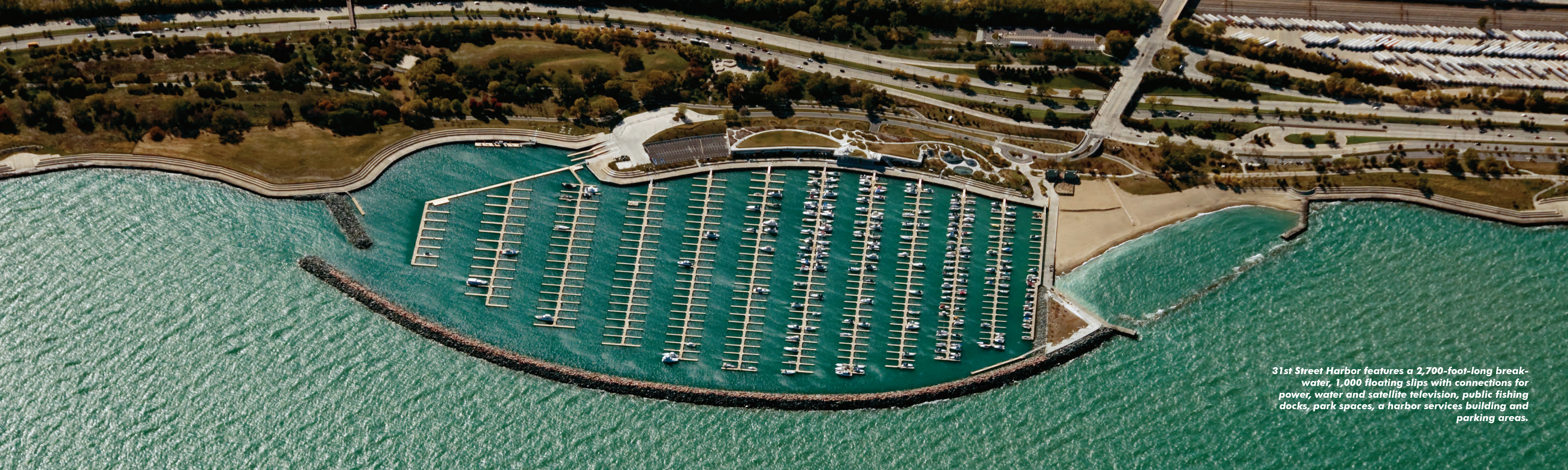
31st Street Harbor features a 2,700-foot-long breakwater, 1,000 floating slips with connections for power, water and satellite television, public fishing docks, park spaces, a harbor services building and parking areas.