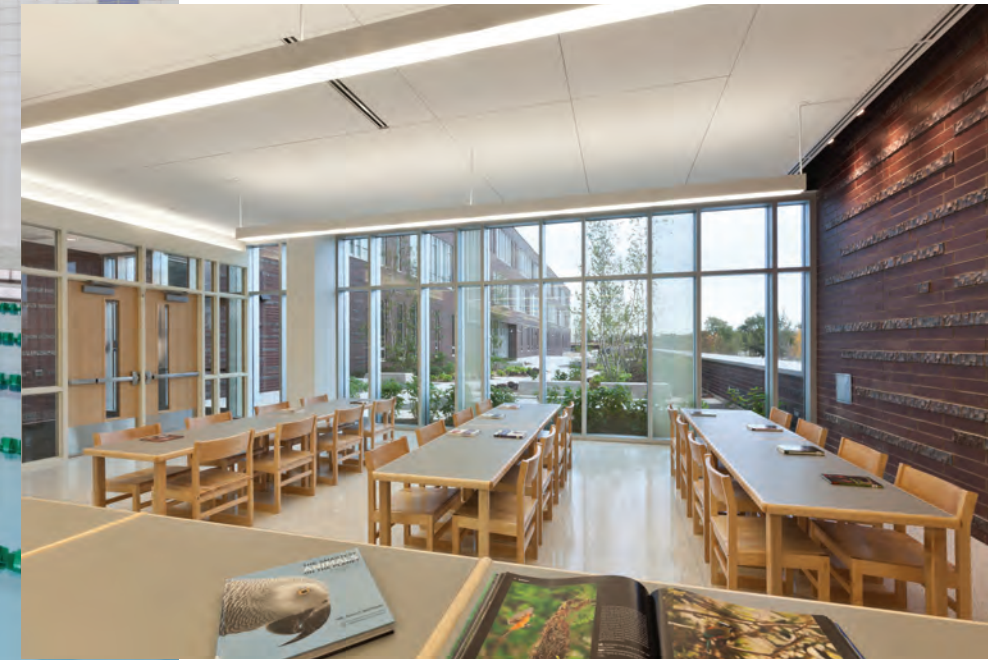
Above: The arts wing includes music/practice rooms, two visual arts classrooms and a library/media resource center. Center: Athletic amenities include a natatorium with six lane pool, gymnasium that converts into a 1,200 seat auditorium, artificial turf soccer and football field, baseball and softball diamonds, tennis courts and track and field venues Far Right: The library/media resource center offers a view of the outdoor reading garden.