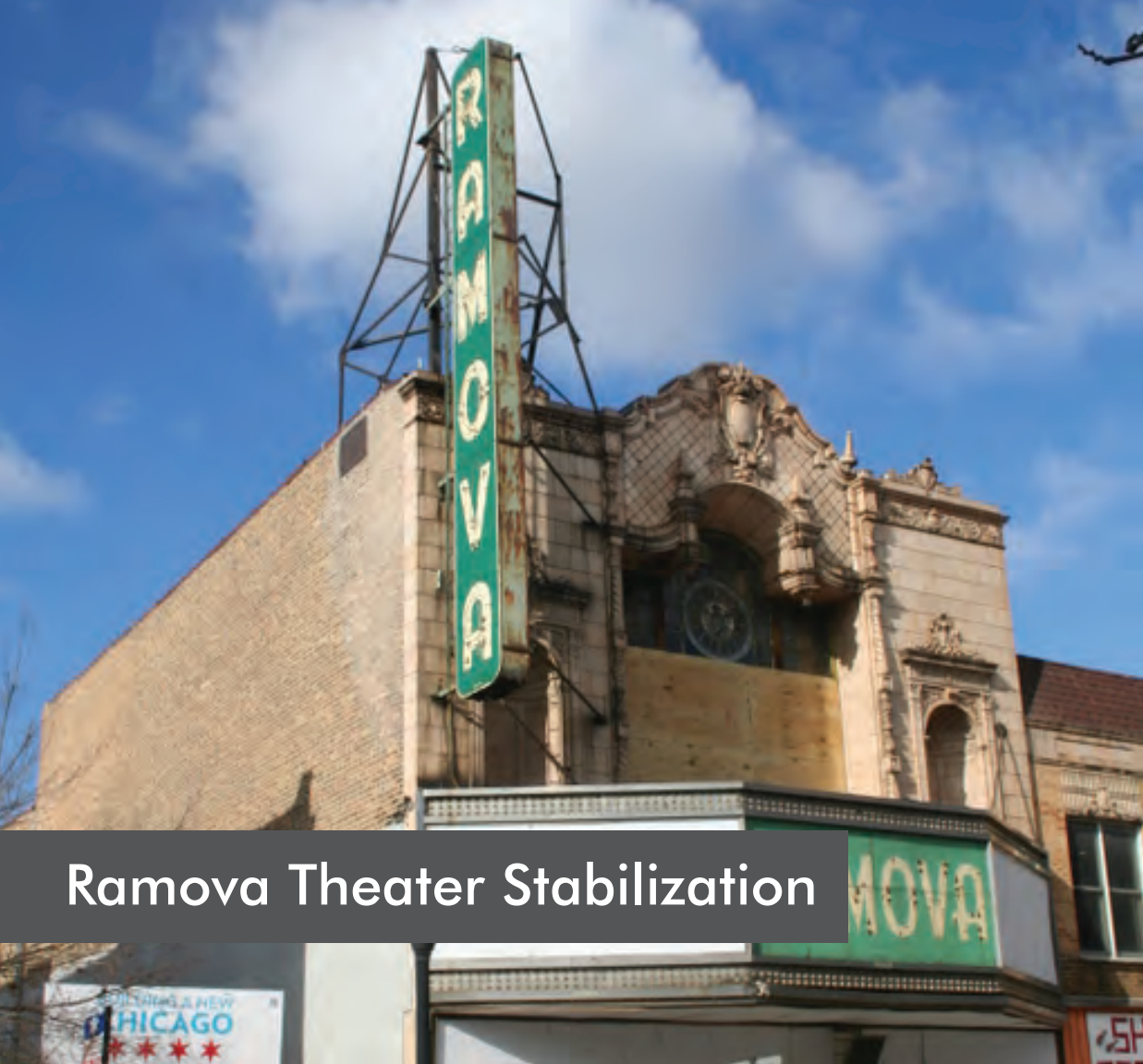
Ramova Theater Stabilization