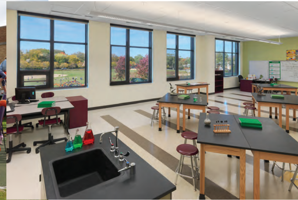
Above: Kitchen and dining facilities Center: The Edgebrook Elementary School Addition project features eight new classrooms, administrative suite, science and computer labs, kitchen and dining facilities, playlot, basketball courts and new parking spaces Far Right: Science lab