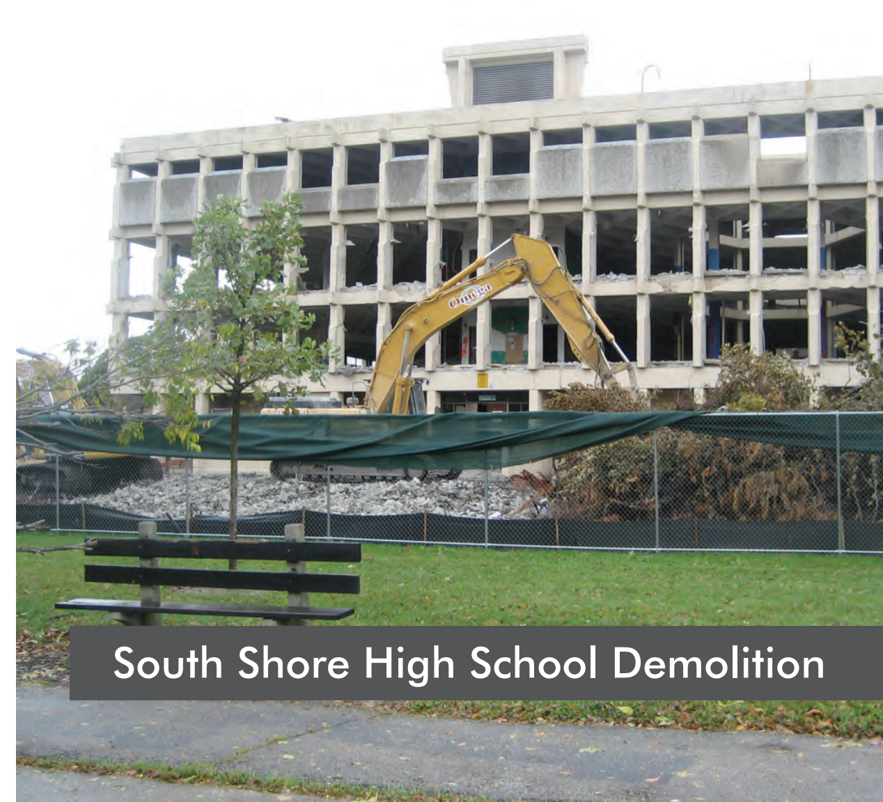
South Shore High School Demolition