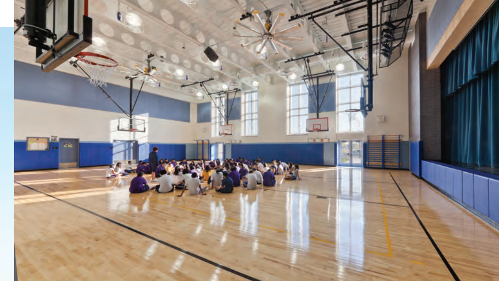
Above: Gymnasium and stage Center: The 101,000 square foot James Shields Middle School has 26 standard academic classrooms, two multipurpose rooms, two computer labs, four science labs and art and music classrooms. Far Left: Art classroom