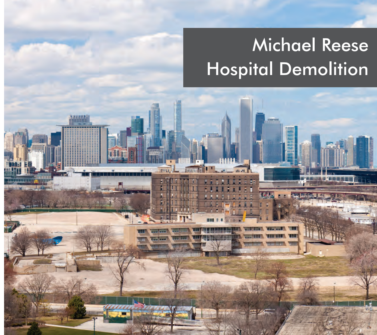
Michael Reese Hospital Demolition