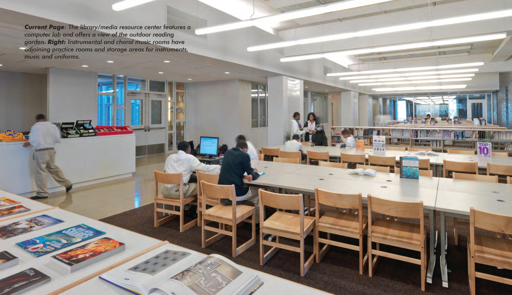
Current Page: The library/media resource center features a computer lab and offers a view of the outdoor reading garden. Right: Instrumental and choral music rooms have adjoining practice rooms and storage areas for instruments, music and uniforms.