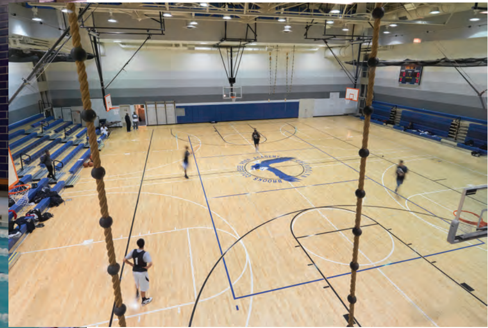
Above: The East Addition includes the auditorium and arts suite, music/practice rooms and a library/media resource center. Center & Far Right: The West Addition includes a two station gymnasium, natatorium and a fitness/weight room.