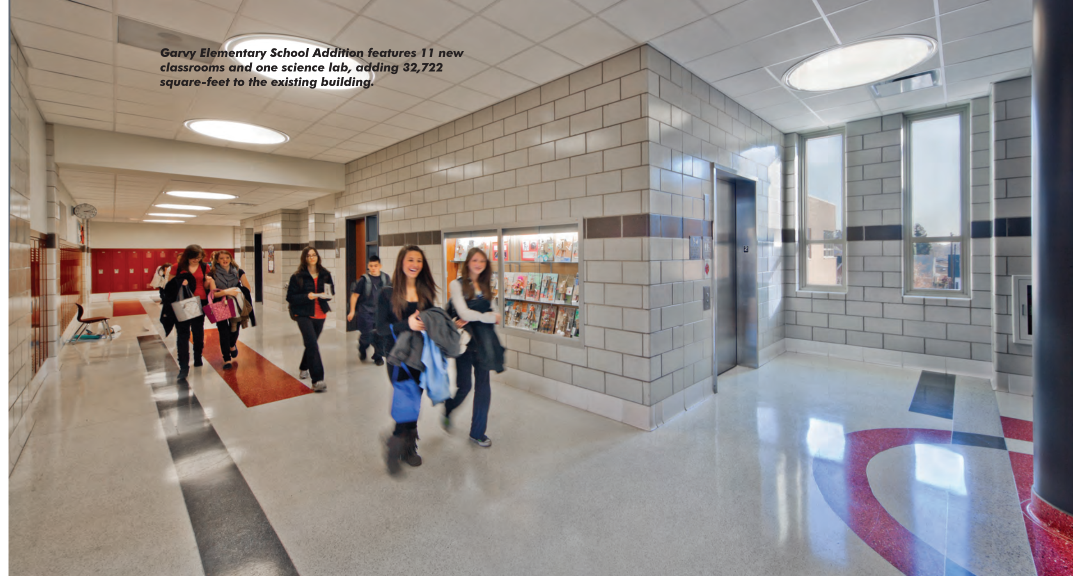
Garvy Elementary School Addition features 11 new classrooms and one science lab, adding 32,722 square-feet to the existing building.