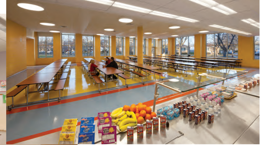
Sauganash Elementary School Addition features 12 new classrooms, one science lab and kitchen and dining facilities, adding 41,865 square-feet to the existing building.