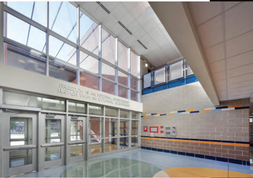
Above: First floor lobby featuring custom terrazzo flooring Center: Powell is designed for community use on evenings and weekends, with independent access to gym, dining room and other specialty spaces. Far Right: Dining room with a view of Lake Michigan