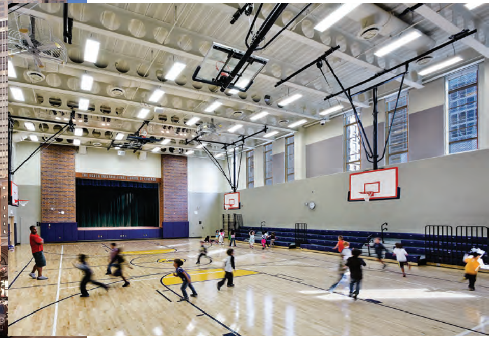
Above: Library and media resource center Center: Ogden is designed for environmental sustainability including photovoltaic windows, stormwater management and a roof-top garden. Far Right: Gymnasium