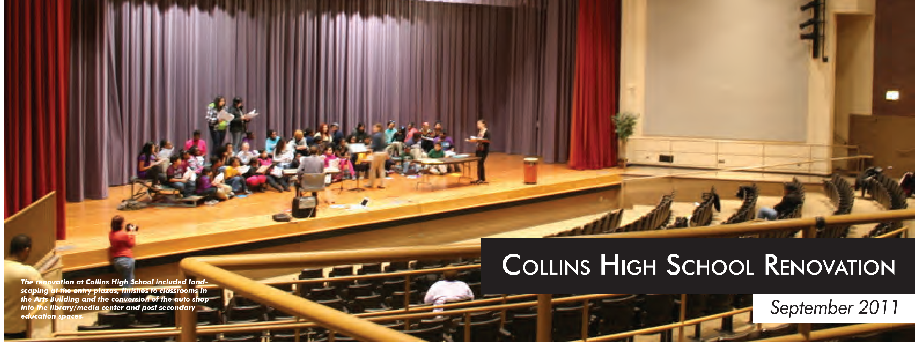
The renovation at Collins High School included landscaping at the entry plazas, finishes to classrooms in the Arts Building and the conversion of the auto shop into the library/media center and post secondary education spaces.